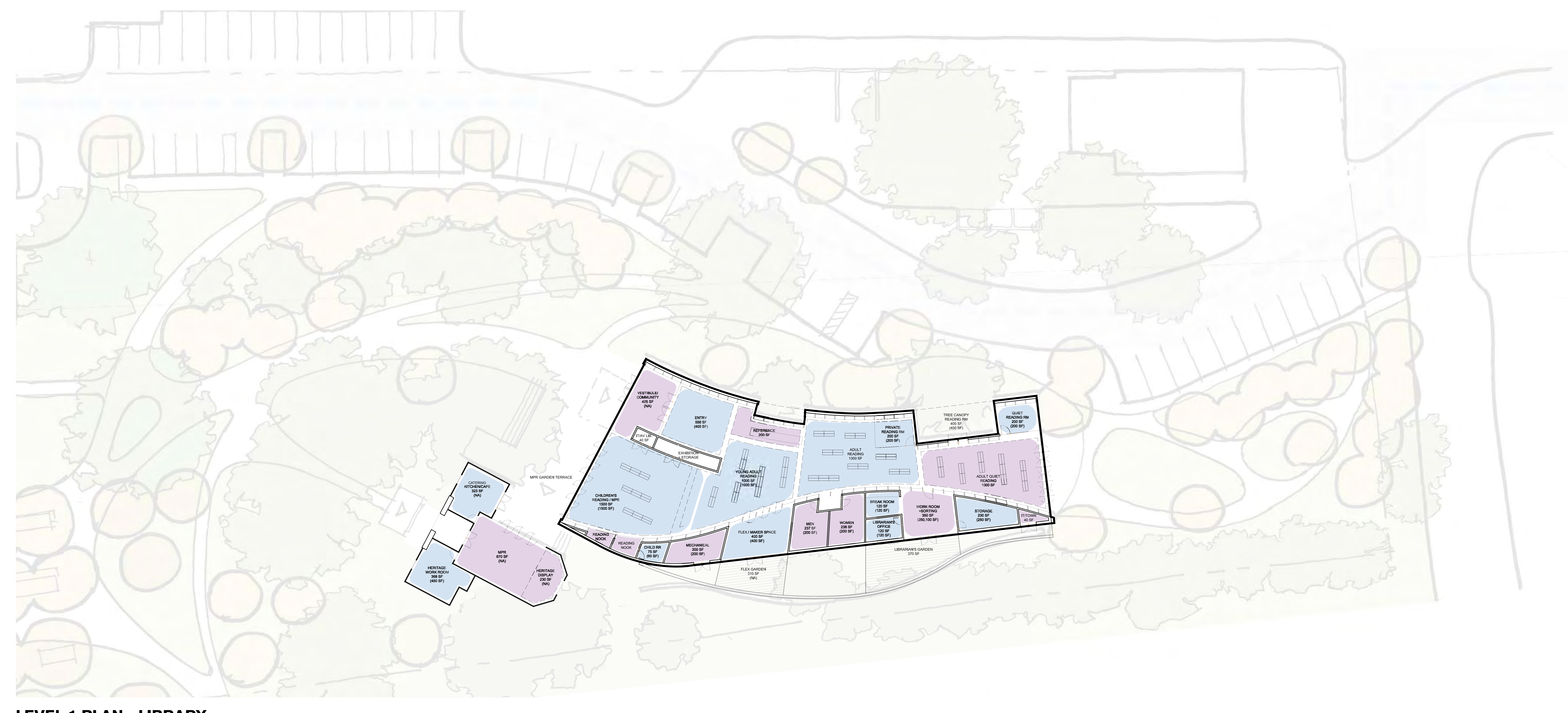
LEVEL 1 PLAN - LIBRARY